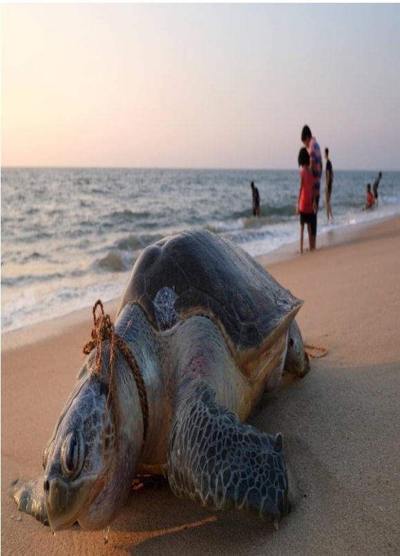
Extinction of Species