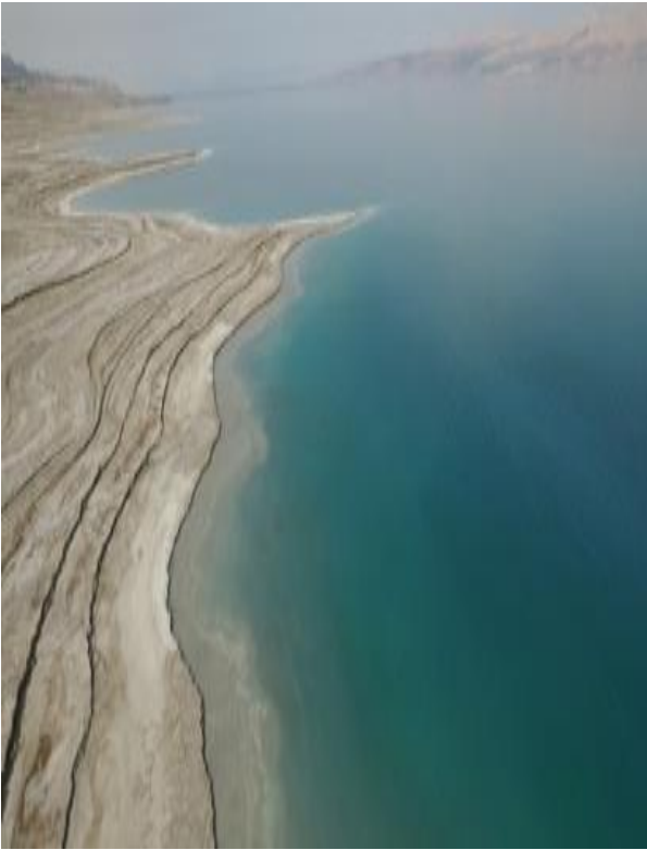
Dead Sea Drying