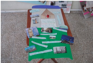
Tourist attractions in London