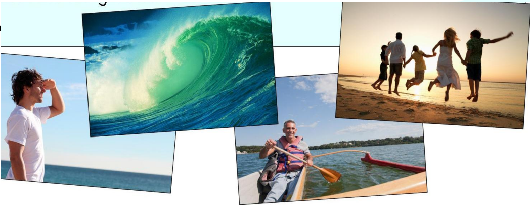
(Adapted from www.britishcouncil.org/learnenglishteens )

People who like animals can also (1) visited/ visit/ had visited the Blue Reef Aquarium and see both fish and sharks. You (2) might/ had to/ be able to also see eels since there (3) are/ would/ had only a few in the area. There are a lot of other attractions, too. You (4) /should/ were/ have come and see for yourself. I'm sure you will have a great time, (5) aren't you/ won't you/ don't you?